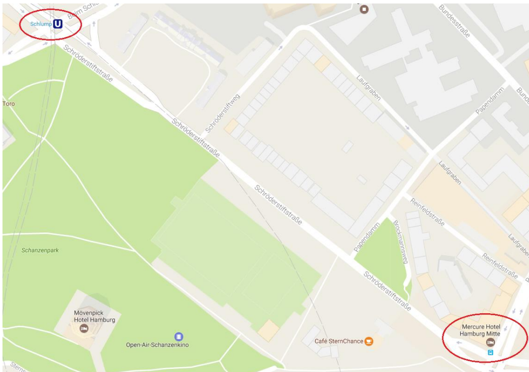
Figure 2 From Schlump to your hotel

The fastest way to reach your hotel from the airport is by urban train (S-Bahn) and subway (U-Bahn). From the airport, you take the S1 (direction: Ohlsdorf). In Ohlsdorf, you change to the subway U1 (direction: Farmsen). Next, you change at Kellinghusenstraße to U3 (direction: Hauptbahnhof Süd). Your destination is Schlump. From Schlump you walk a few minutes along Schröderstiftsstraße to your hotel (see Figure 2).